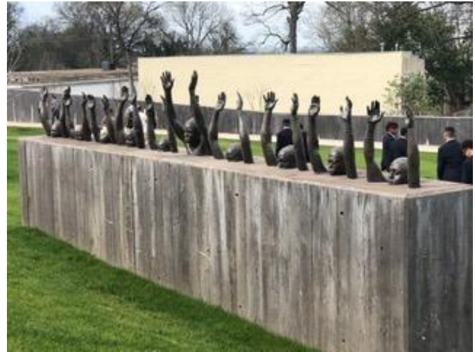
The Young Men from the Come Thirsty Ministries at the Legacy Museum in Birmingham.