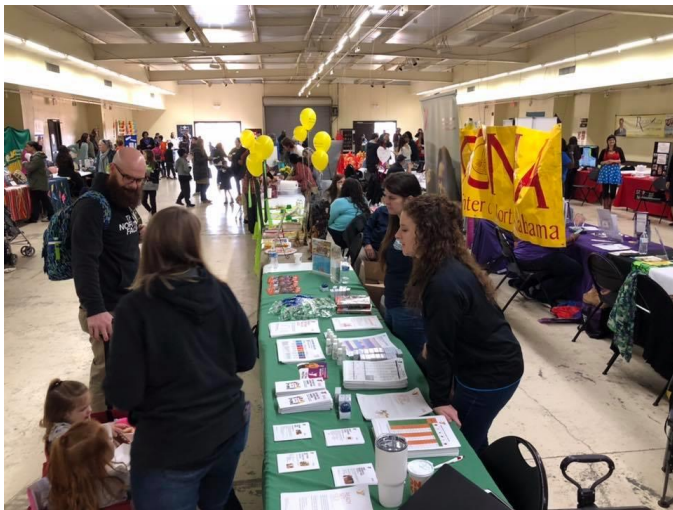
Photos from the Kite Festival