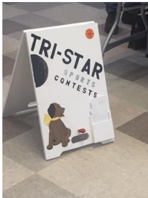
Sign for Tri-Star Contest Made by Richie Myers