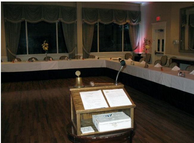
Our Meeting Room