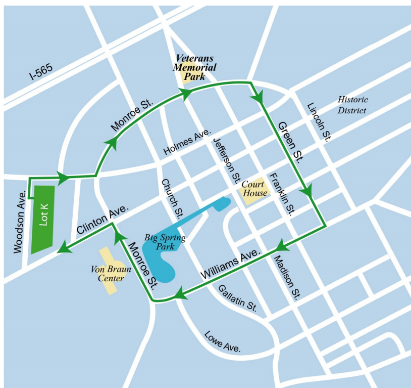
Figure 1. Parade Route