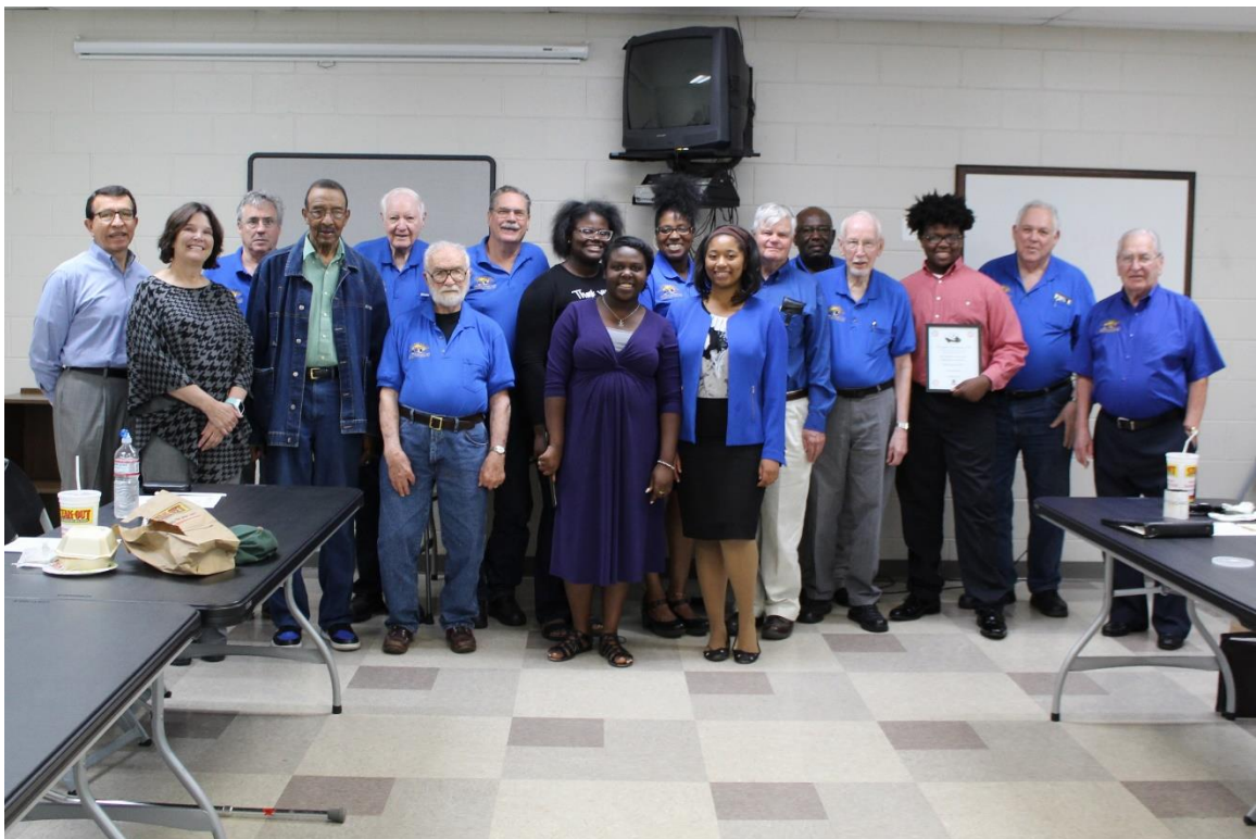
Club Members with the Three Young Speakers.