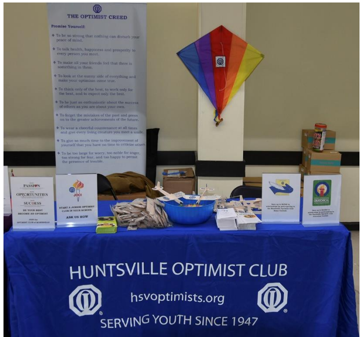
Our Club's Booth at the Kite Festival