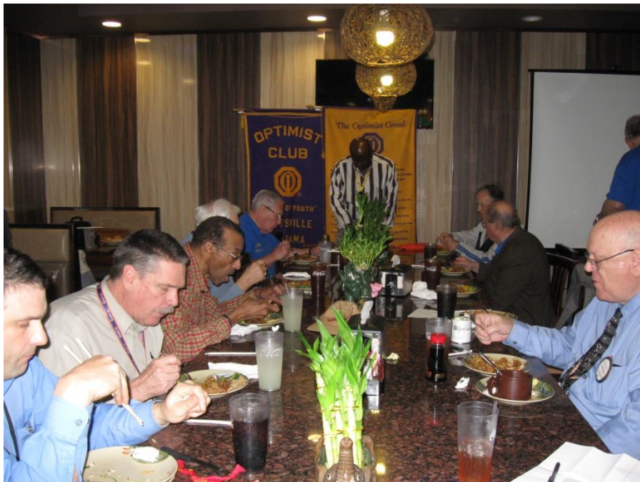
Our Meeting Room at 88 Buffet