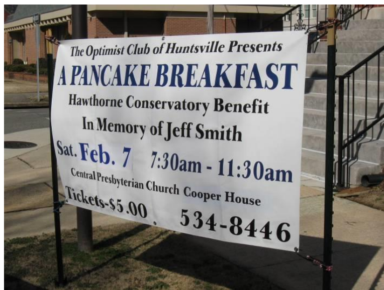
Pancake Breakfast sign in front of the Central Presbyterian Church