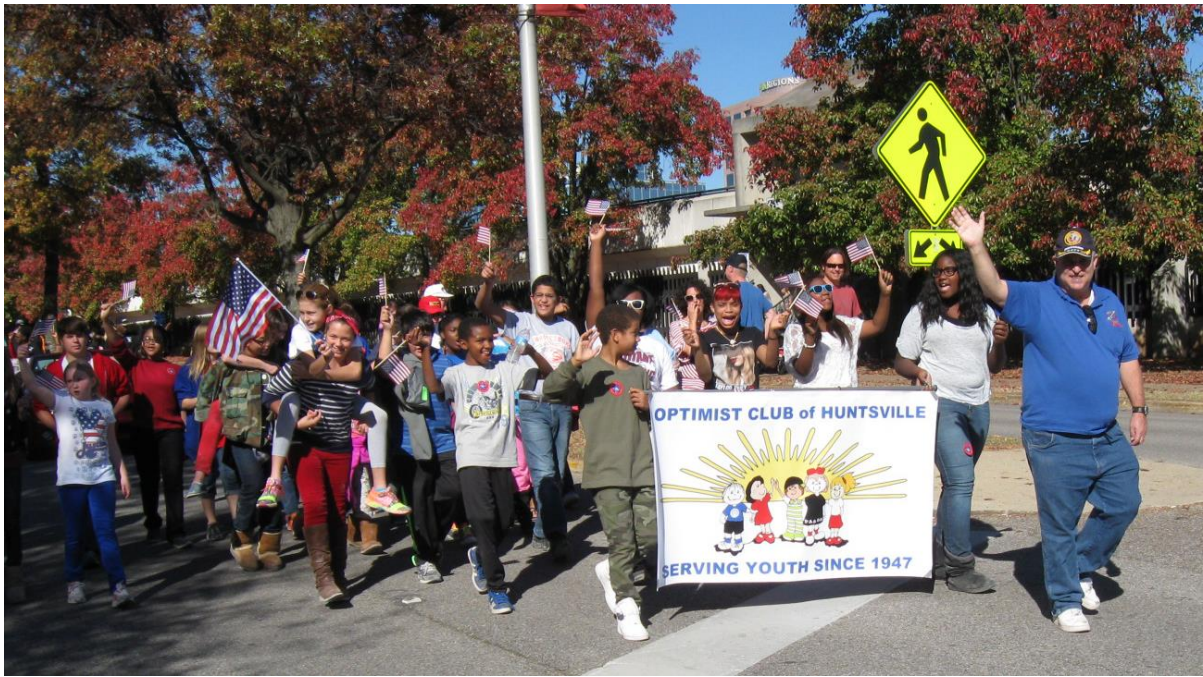
John Inman and the JOOI Kids