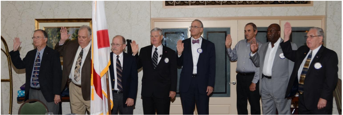
The New Officers all Swear to do Their Best