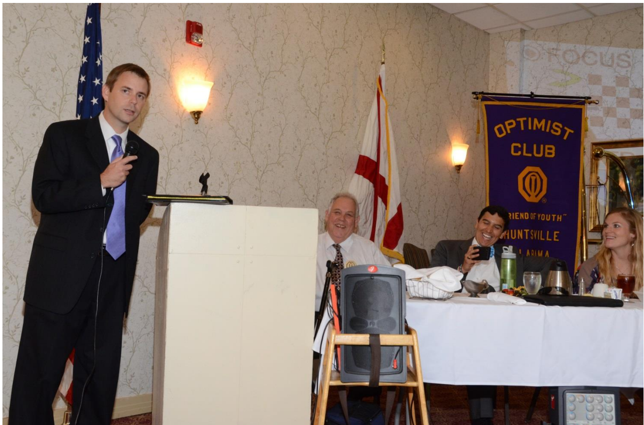
Matt Hancock Reads His Top Ten