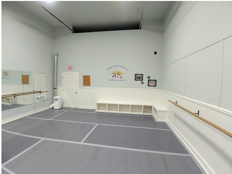
The Completed Room, Note the Club Emblem on the Back Wall