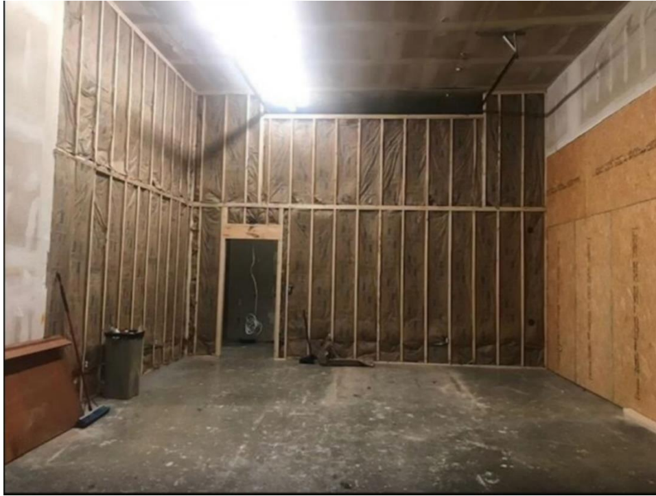
The “Before View” of the area for the Dance Studio