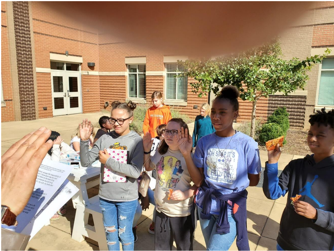
The Whitesburg Junior Optimist Club Officers are Installed