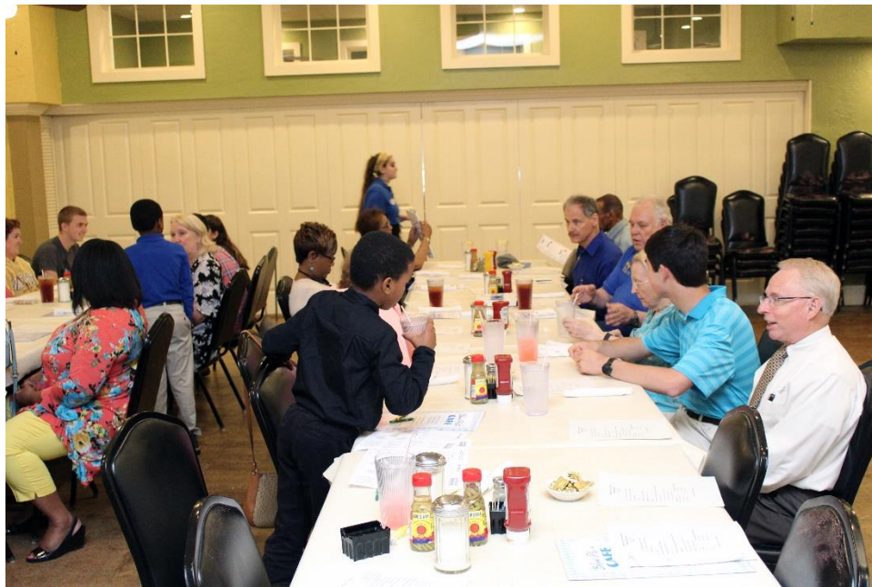
Fellowship Before Meeting