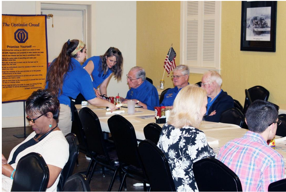
Fellowship Before Meeting