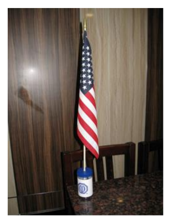
The flag for reciting our Pledge of Allegiance