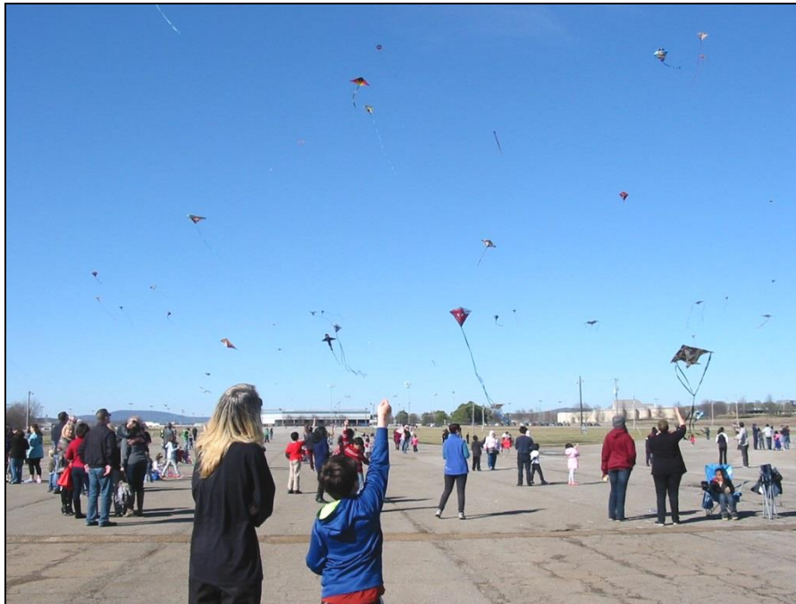
A Beautiful Day for Kite Flying