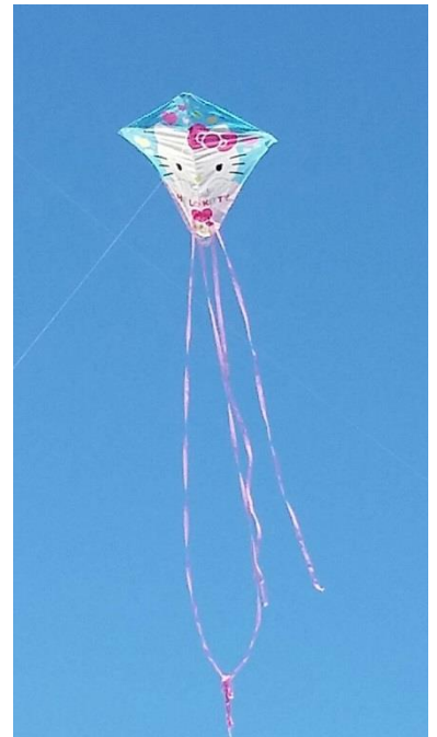
Some Examples of Kites Being Flown