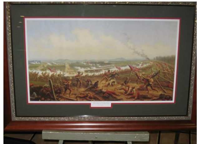
A print of the painting The First Day of the Battle of Gettysburg .