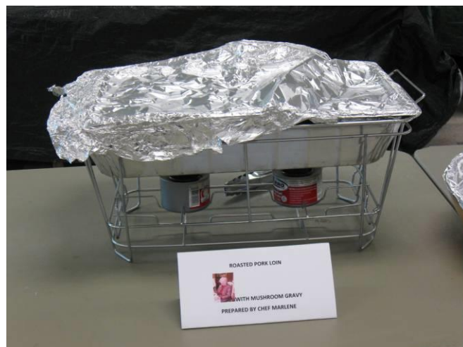
Under the foil is our delicious lunch entrée.