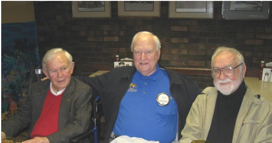
Old Timers Row