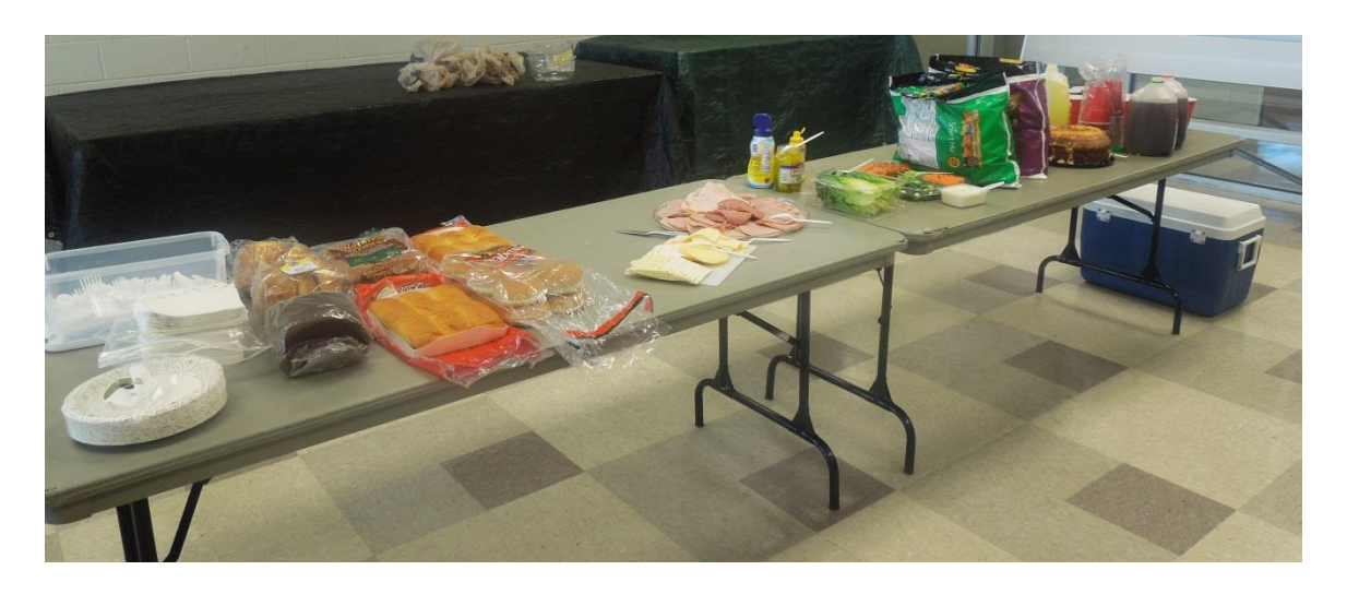
The Lovely Spread Gay Pepper provided